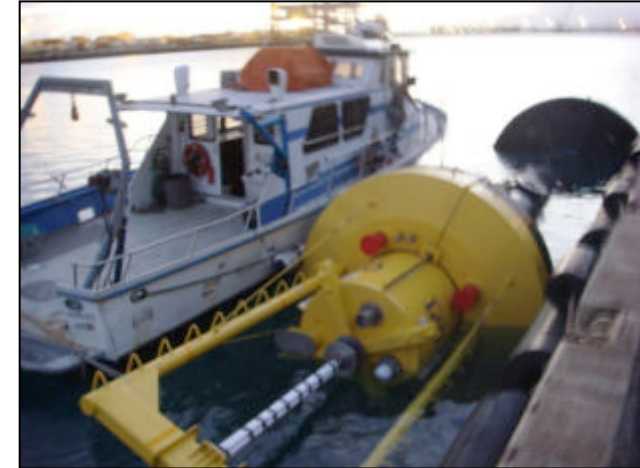
Hawaii PowerBuoy ready for deployment – Sept. '08