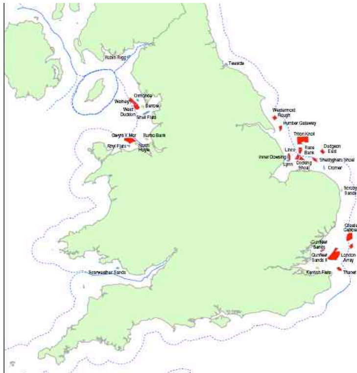
Rounds 1 & 2